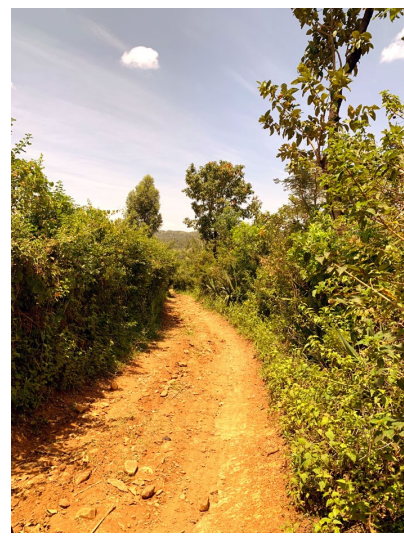
Road to Otacho, Kenya