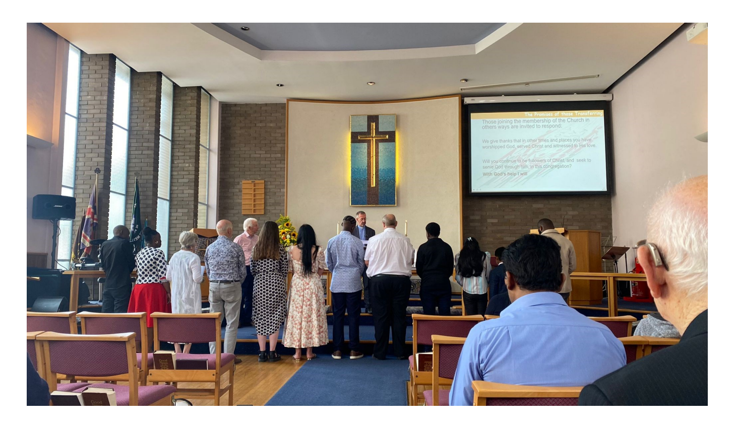
We had a full church, and a lovely service.