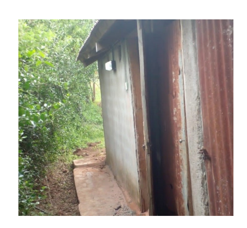
Lights on main gate & on toilets