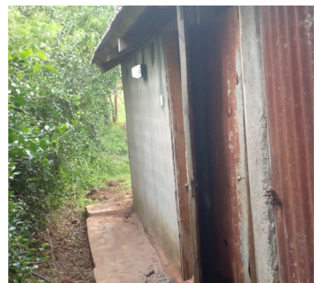
Lights on main gate & on toilets